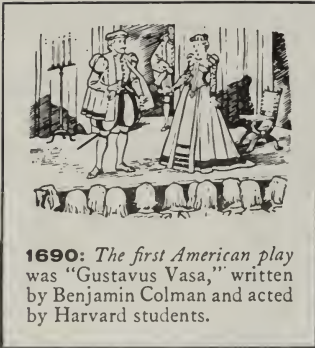
1690: The first American play was "Gustavus Vasa," written by Benjamin Colman and acted by Harvard students.