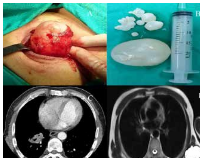
Figure 1. A three-dimensional computed tomography scan showing an expanding cystic mass in the 9th and 10th ribs with destruction of the vertebral transverse process, seen in the (A) anterior and (B) anterior view with soft tissue; and conventional thorax CT of the Axial (C) and coronal (D) images show destruction in the ninth and tenth ribs.

localization of HCs are extremely rare and differentiated from other bone ones with destruction in rib or bone matrix and rupture risk for surrounding tissues and recurrence. First of all, it is localized in calcium-containing bone although it is porous, unlike soft tissue. Dew has demonstrated it; embryos have been restricted to bone due to high vascularity and have been found to invade other bone and peripheral tissue fragments.